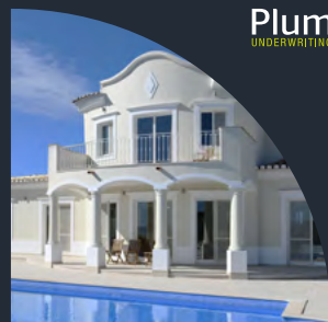
Overseas Holiday Home