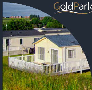
Caravan & Lodge Home