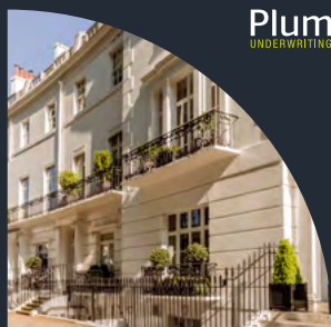
Non-Standard UK Home