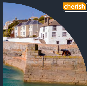
Bed & Breakfast