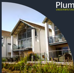
UK Holiday Home