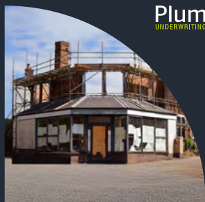
Commercial Building Works