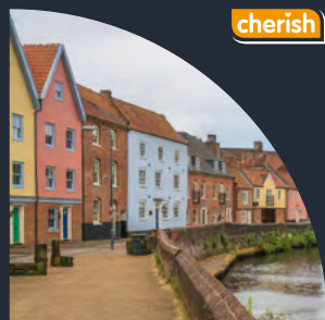
Second Home, Family & Friends, Paying Guests