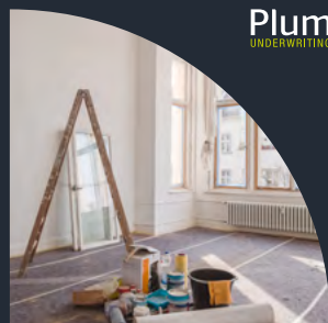
Residential Building Works